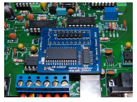
Module mounted on HP-UHU